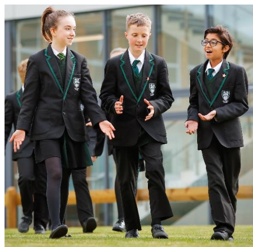
Picture to the right: Three of our students looking very smart and ready for the day ahead!

Once you have made your list have a chat with your parent/carer about anything else you may have forgotten.