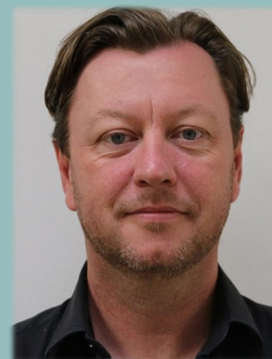
Mr Mallinson Sports Academy

“Sixth Form students are learning more effectively through challenges set and tougher expectations of what they can achieve” ofsted