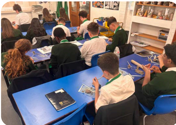
This week, Year 9 started to create their Lewis chessmen inspired chess pieces from clay.